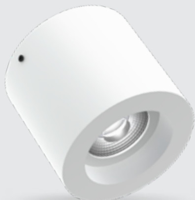
Lens HV-FD 40°