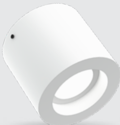
Diffuser HV-FD 80°